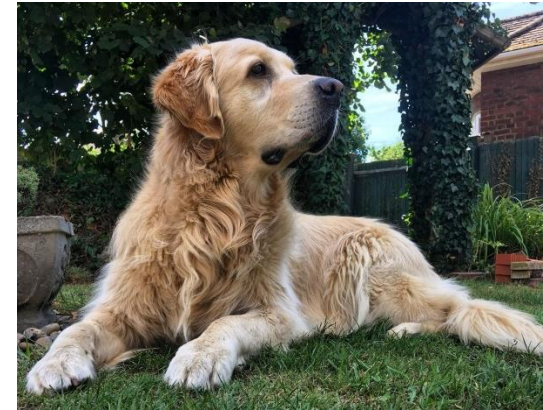
Sully 5 years