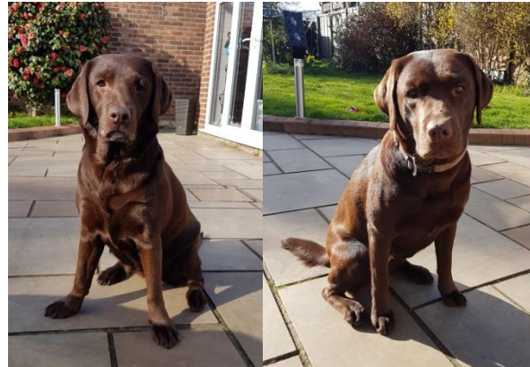
Nala 6 years