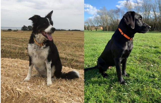
Layla 4 years